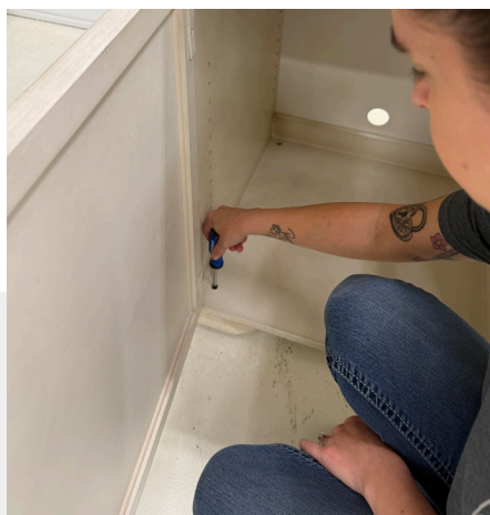
Use flathead screwdriver to adjust leveling glides from inside case.