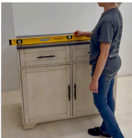
Check front-to-back and side-to-side level of case.

Step 3. Once leveling is complete use caps provided to cover the pilot holes and prevent debris from collecting in holes.